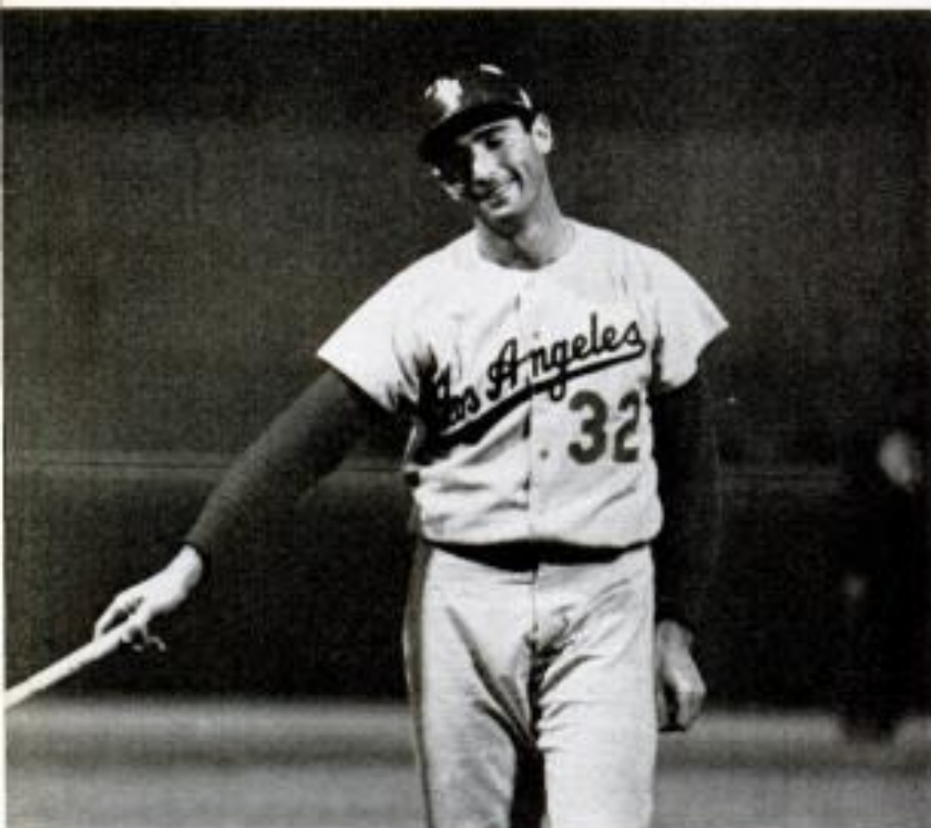
Pitcher Koufax, no giant with the bat, grimaces after striking out.

Three years ago, Southpaw Sandy was blazing fast and terrifyingly wild. Then, taking a teammate's advice, he slowed down his pitch and thus controlled it. Still far faster than almost anybody else, he can now pitch the ball where he wants it—and, besides, has a curve which "jumps a foot," according to Willie Mays. "It's too good a life," says Sandy. "When will it end? The hitters will let me know."